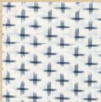
the artisan project